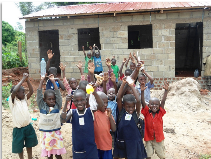
Happy students in front of the teacher housing