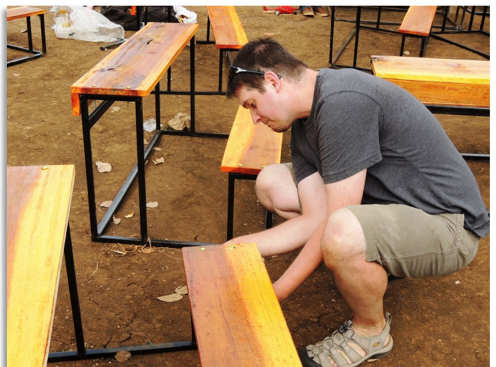
Another hardworking GIVE volunteer constructing desks