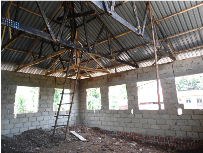
3 rd classroom under construction in January 2014