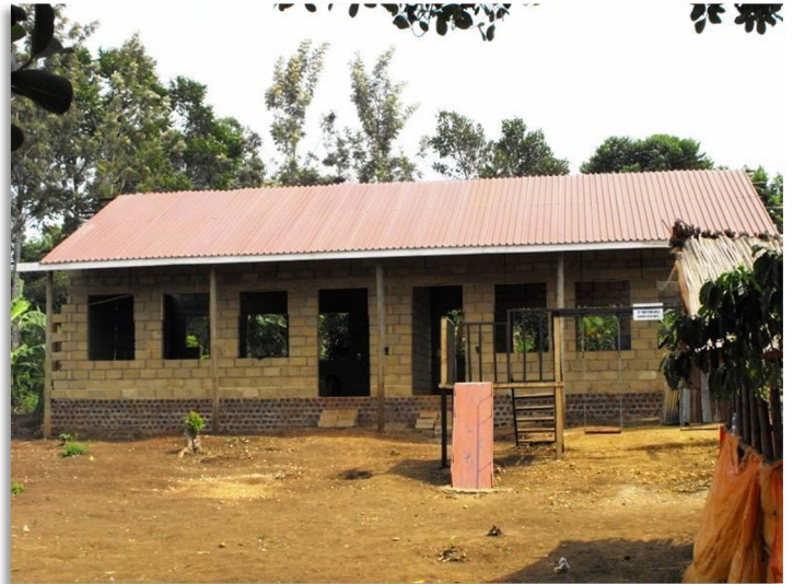
Front view of the new classrooms