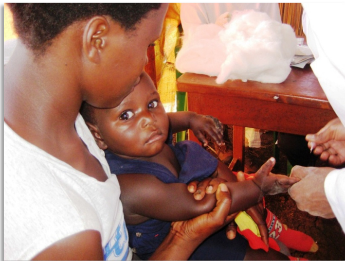
A young mobile clinic patient during a malaria lab test