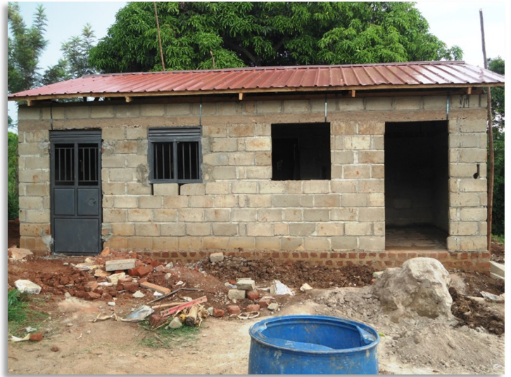
Front view of teacher housing