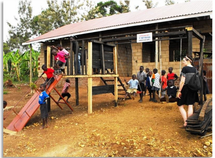
Students making use of new playground