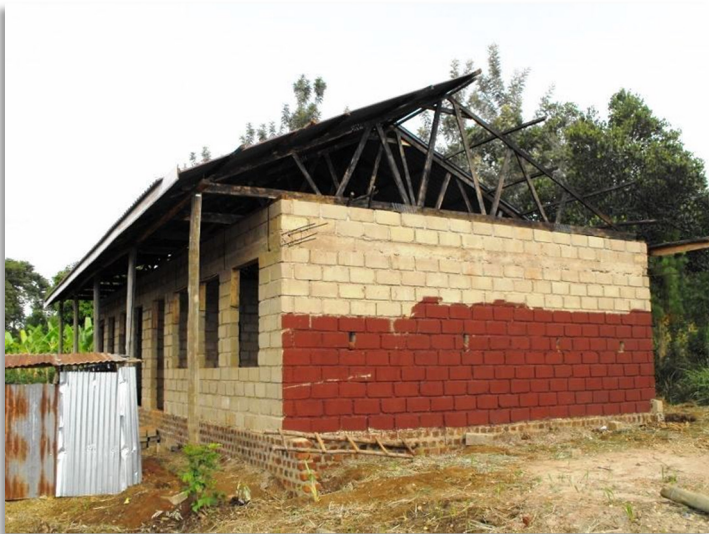
New classrooms being painted