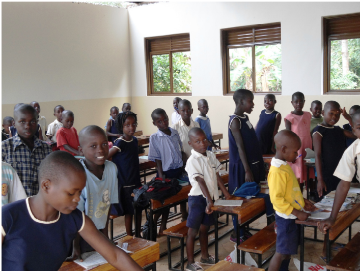
New classrooms in use!