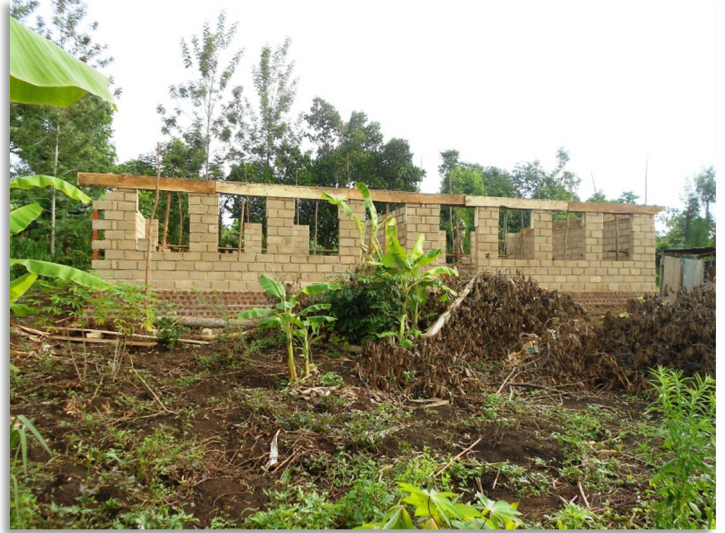
New classrooms being constructed in January 2012