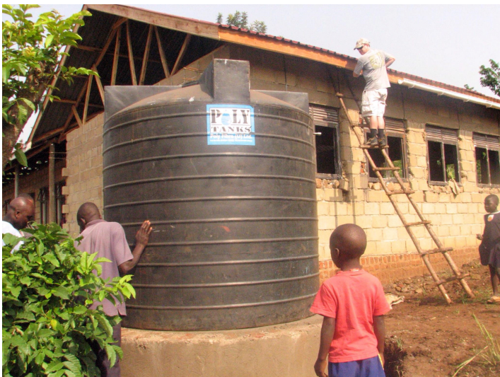
Newly constructed and installed 10,000 litre rainwater-harvesting tank