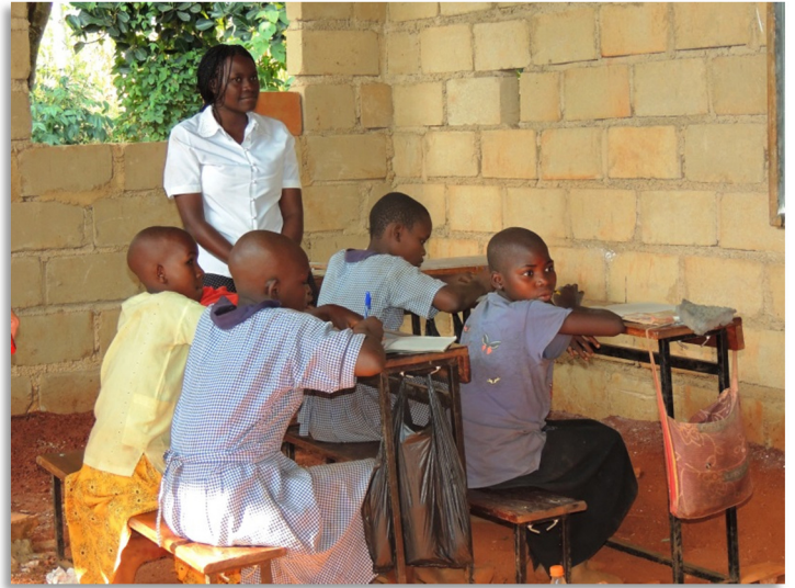
Students making use of their new desks