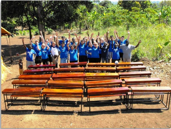
Desk construction accomplished!