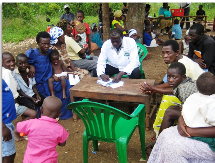
Mobile clinic "triage" site