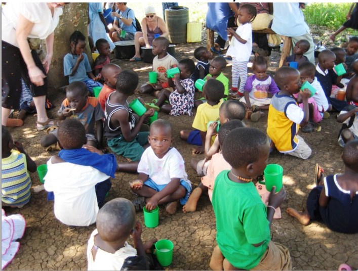
School breakfast feeding underway