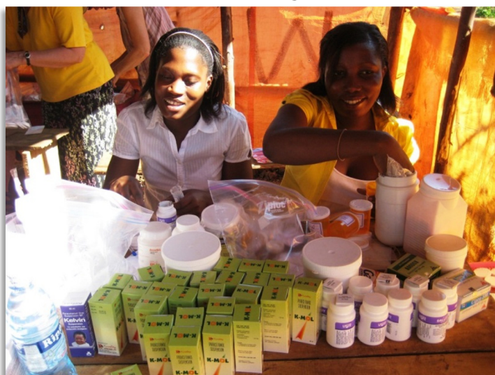
Mobile clinic pharmacy ready for business!