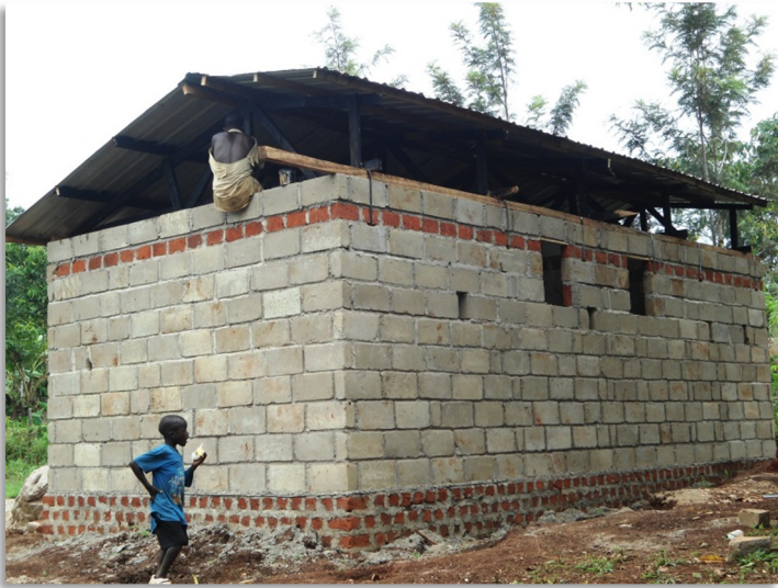
Exterior view of teacher housing