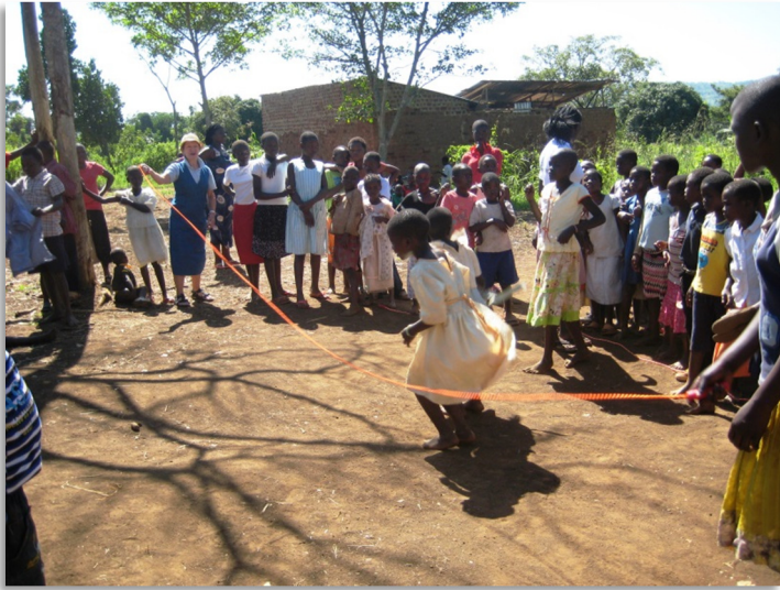
Students enjoying their new skipping rope during recess