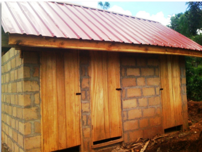
3 new pit-latrines constructed