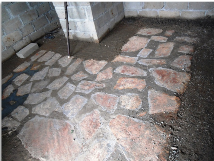
Teacher housing floor