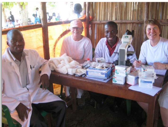
Mobile clinic laboratory and testing centre