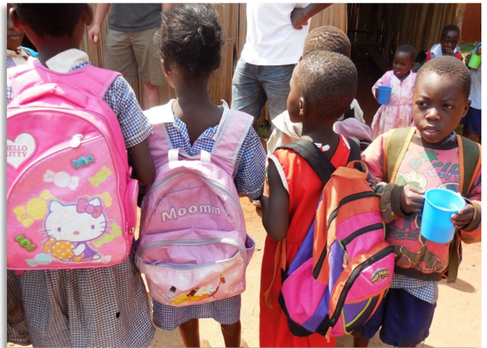
Students wearing their school kit backpacks