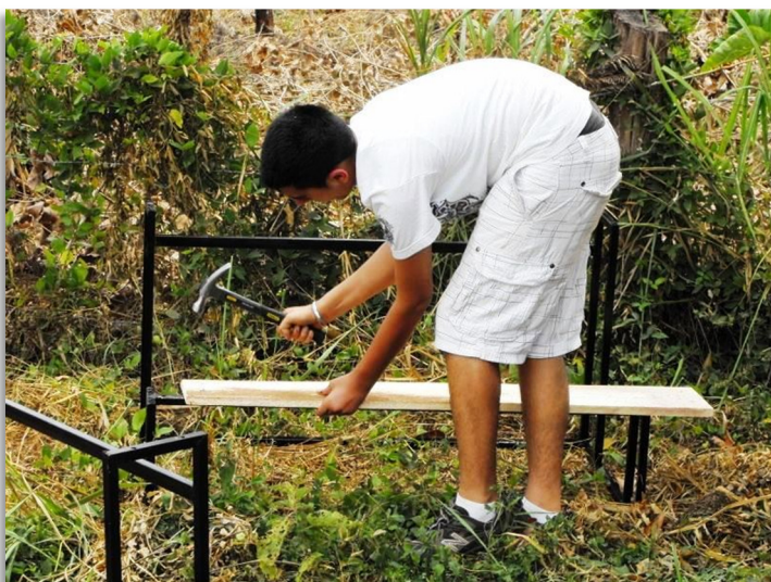
A GIVE volunteer constructing classroom desks