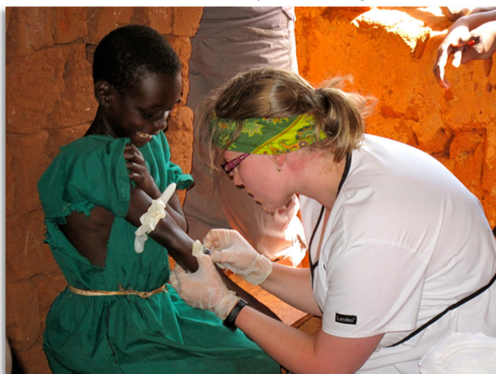
A qualified GIVE volunteer administering a lab test