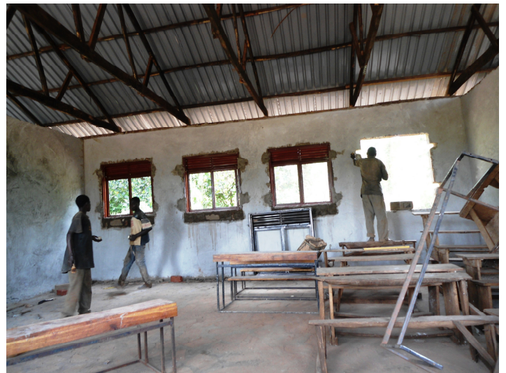
Windows being installed in the 3 rd classroom