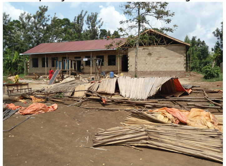
No longer needed, the former school structure collapsed in January 2014.