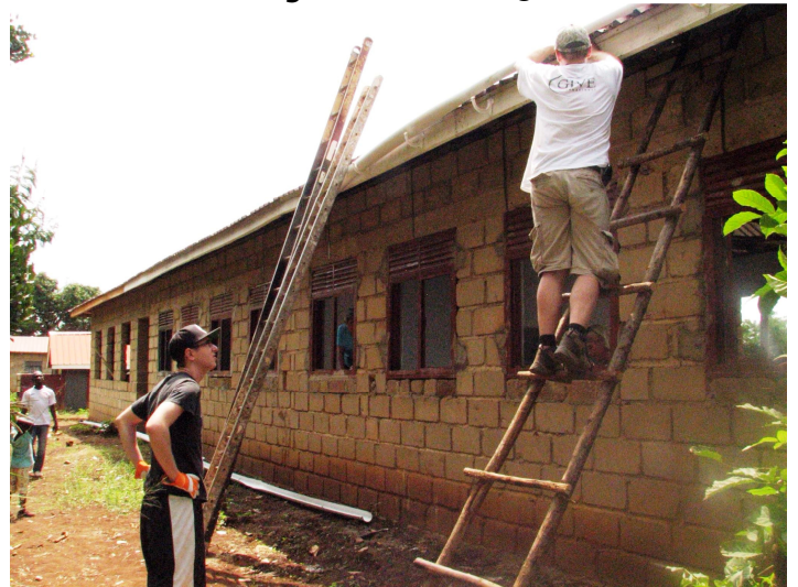
Exterior view of the completed classrooms & installation of downspouts for the new rainwater-harvesting tank