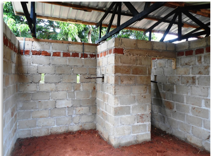
Inside one of the teacher houses