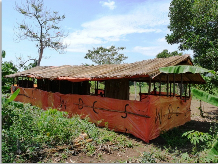
Former primary school structure